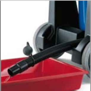
▲ Built-in drain hose Drain the container of the WD 7 machines with the built-in drain hose.