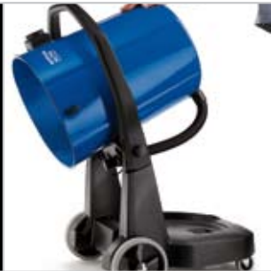
▲ Versatile container handling Tilt the container on the WD 7 machines can for easy emptying.