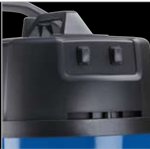
▲ Simple and Flexible Choose 2 motors for the difficult tasks, or 1 motor for normal work.

MAXXI WD 7 DUO - Two motors for the heavy work • 2-motor performance - Ideal for Agriculture and Construction work.